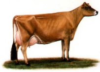
Central Valley Jersey Breeders